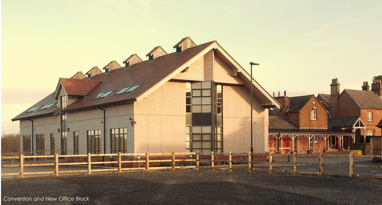
Conversion and New Office Block