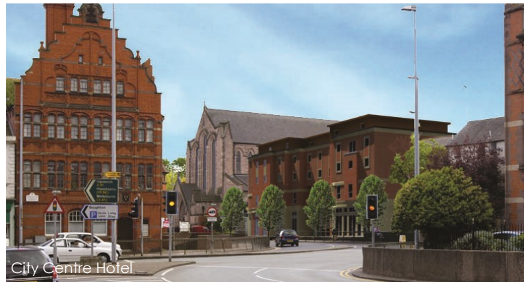
City Centre Hotel