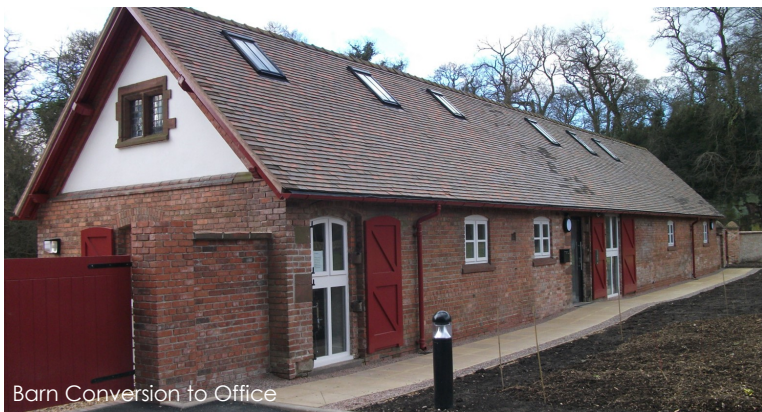
Barn Conversion to Office

T weed Nuttall Warburton provide award winning solutions for our commercial clients. We have a broad experience in the commercial sector working on everything from agricultural sheds, multi-million pound factories and office buildings to city-centre hotels, pubs and zoo projects.