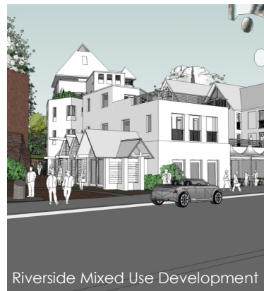
Riverside Mixed Use Development