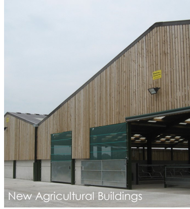
New Agricultural Buildings