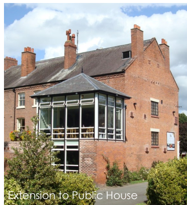
Extension to Public House