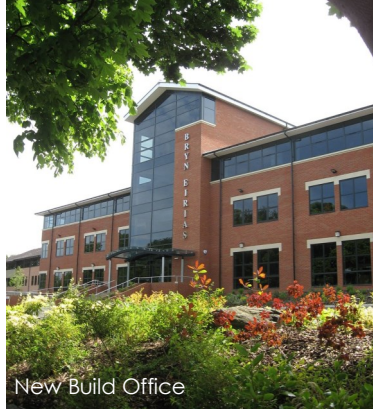
New Build Office