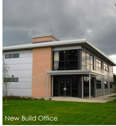
New Build Office