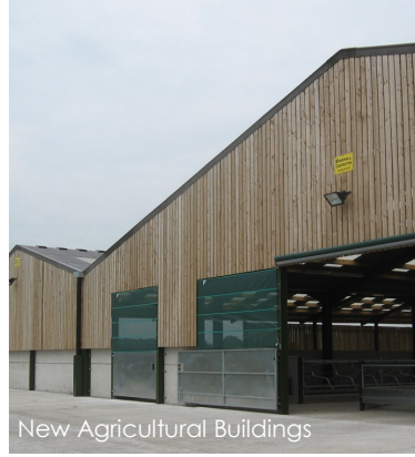
New Agricultural Buildings