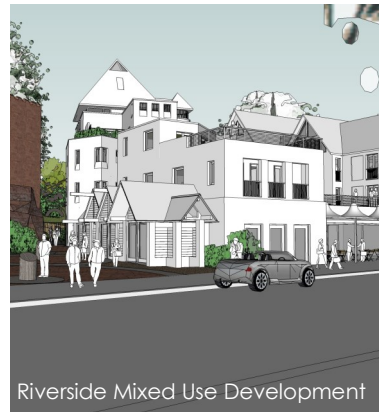
Riverside Mixed Use Development