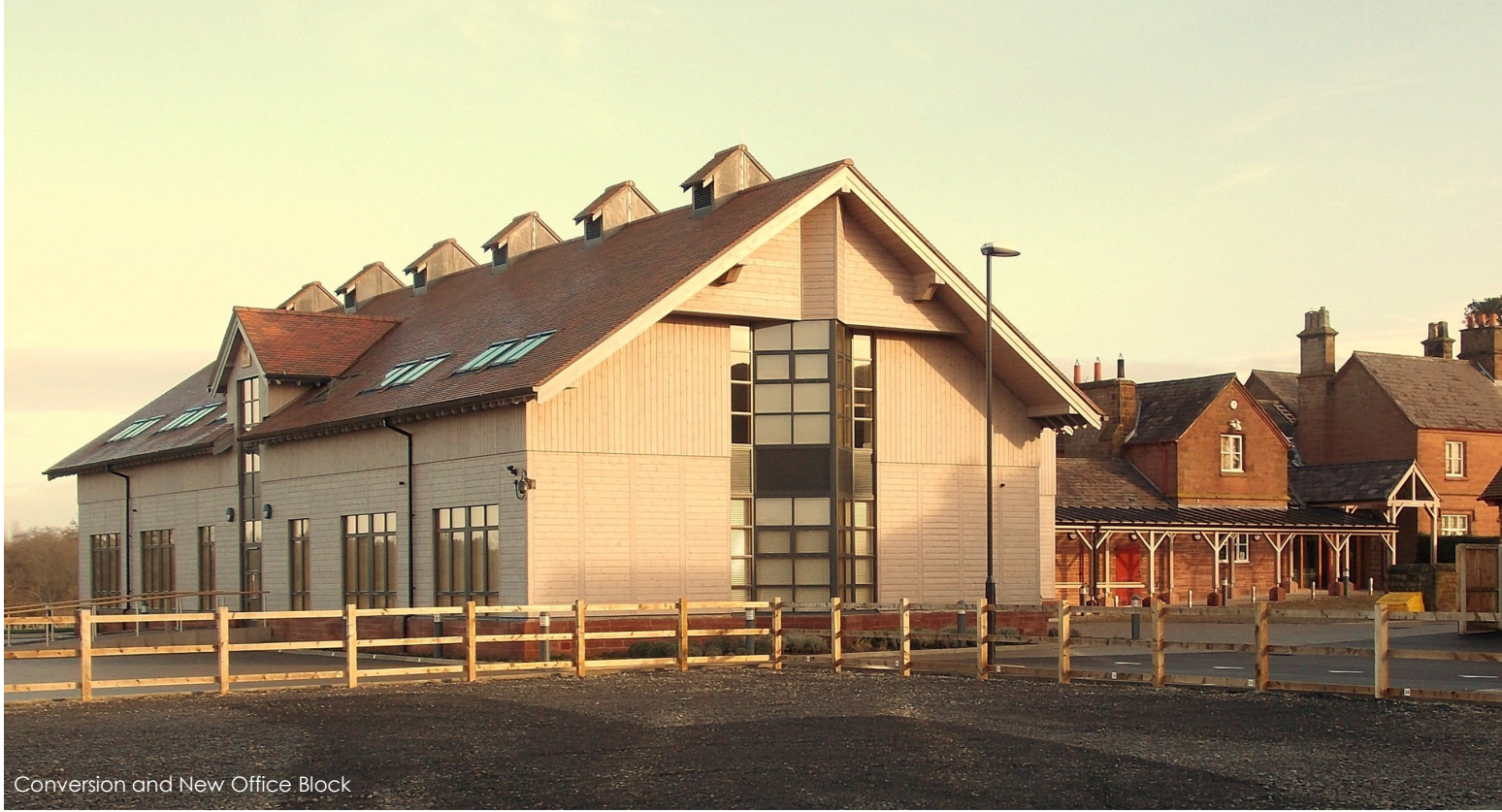
Conversion and New Office Block