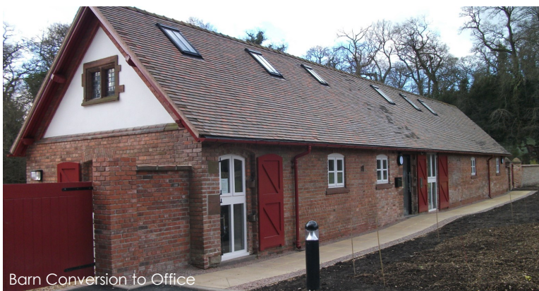
Barn Conversion to Office