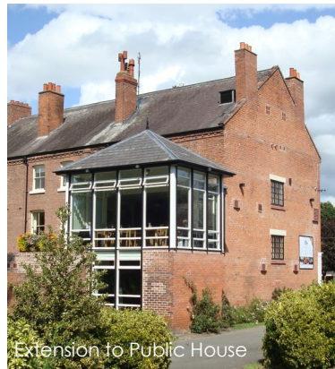
Extension to Public House