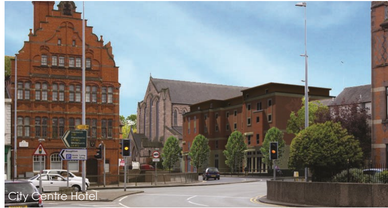
City Centre Hotel